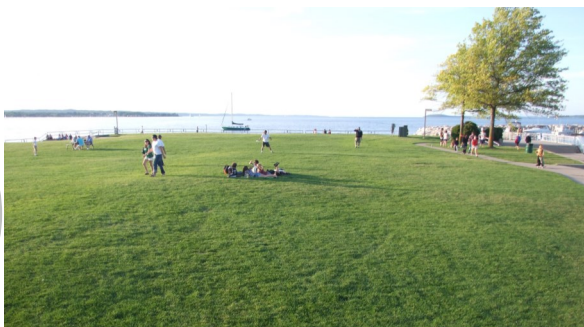
Above: The Open Space