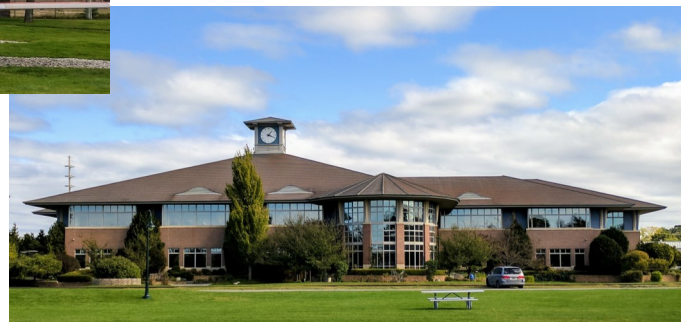
Above: Traverse Area District Library