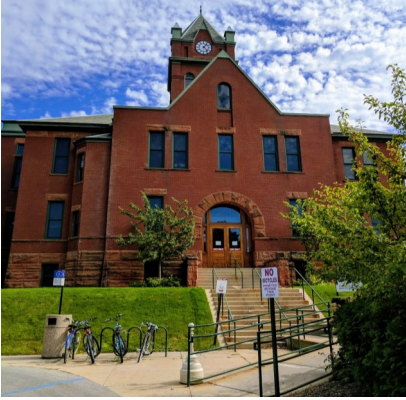
Below: Historic Courthouse