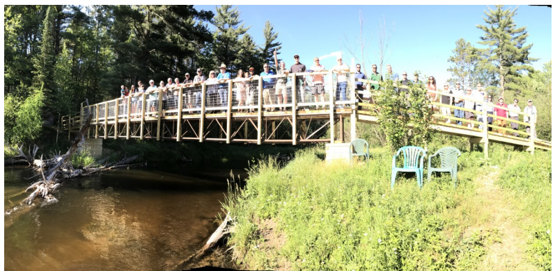
Above: Brown Bridge Area Footbridge