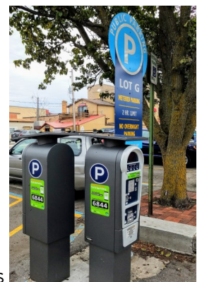
Right: Parking Pay Stations