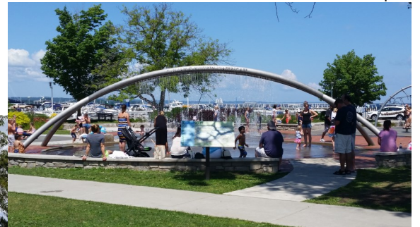
Below: Clinch Park Waterscape