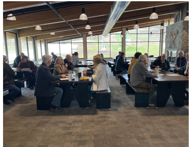
Pictured above: listening session with Boardman and Oak Park neighborhoods at Raduno (left) and listening session with Morgan Farms neighborhood at Hickory Hills (right).