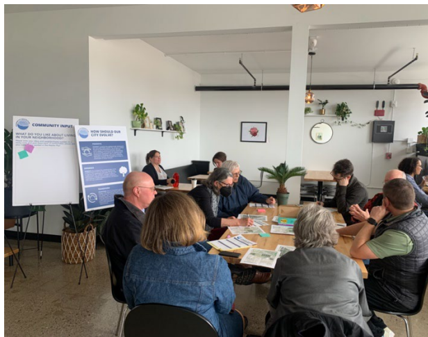
Pictured above: listening session with SoFo, Fernwood, and Top of the Hill (not an official designation) neighborhoods at Grand Traverse Circuit (left) and listening session with Oakwood and Triangle (not an official designation) neighborhoods (right).